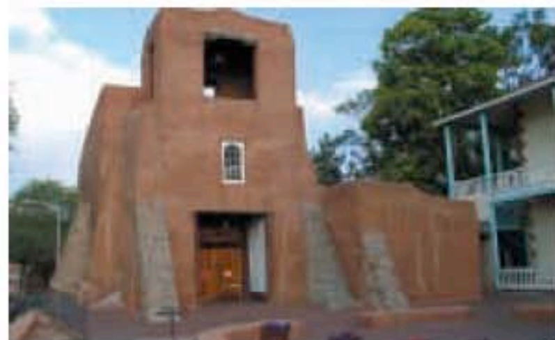
Above, left: Inn Of Five Graces, Santa Fe; above, right: San Miguel Chapel in Santa Fe is the oldest church structure in the United States. The adobe walls were constructed around A.D. 1610

homey Christmas with you, there's little reason not to have your own White Christmas cabin, complete with fireplace, smores and your own snowman-making kit. All the memories of a Christmas Card White Christmas personalized with your very own holiday mementos.