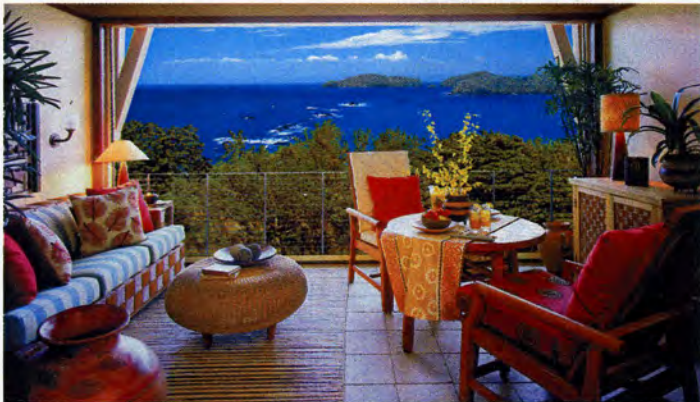
Above: A view from the Four Seasons Resort Costa Rica at Peninsula Papagayo. Top right: The Four Seasons Resort Whistler.

Costa Rica should continue to gain popularity as a vacation destination with the opening of a Four Seasons in February 2004. The Four Seasons Resort Costa Rica at Peninsula Papagayo will be flanked by beaches that border a set of bays on the Pacific Ocean. All 153 rooms and suites and 20 villas in the complex will offer spectacular views from either