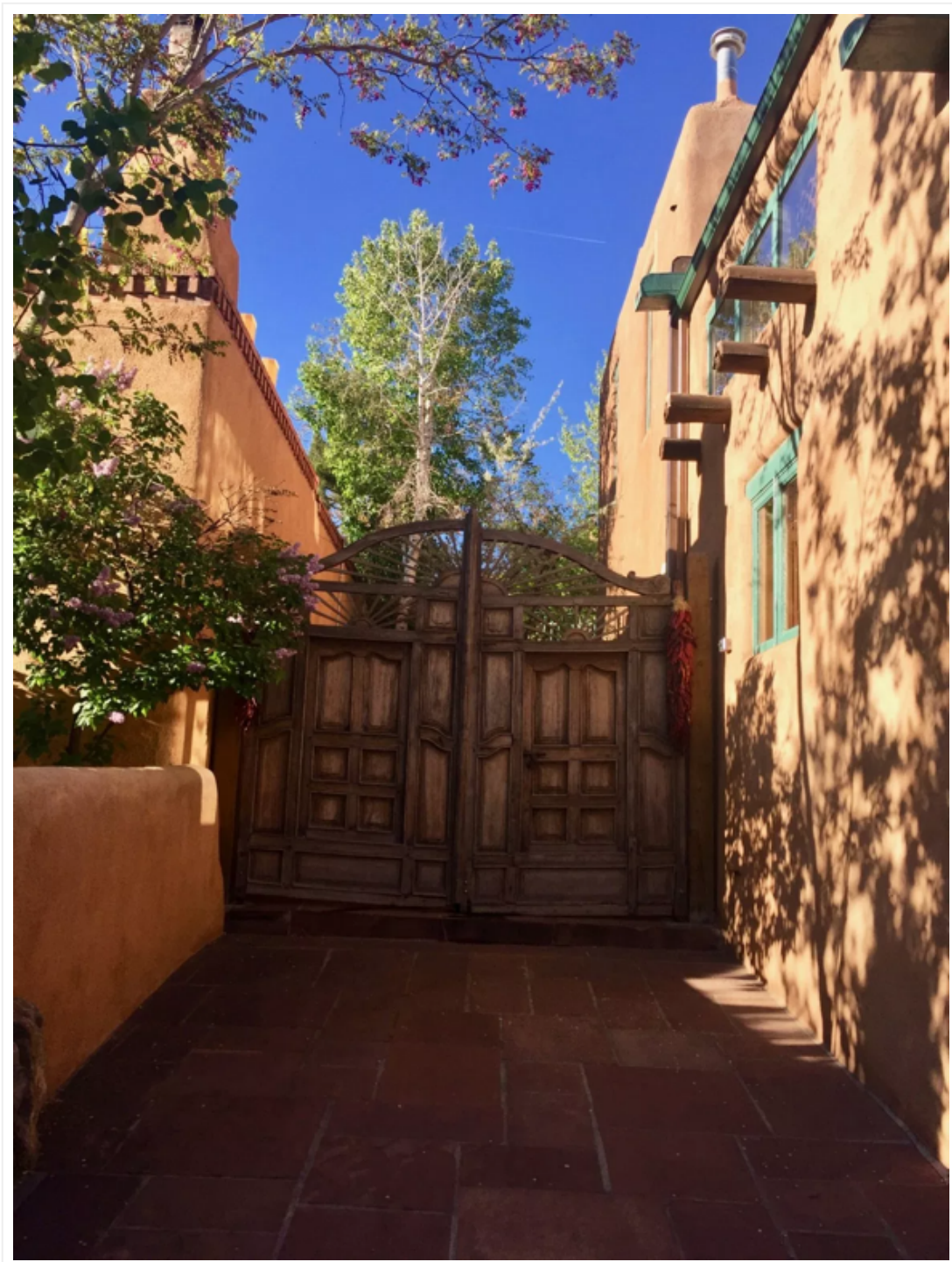
— Inn of the Five Graces Santa Fe, New Mexico

Don't miss a visit to the Seret and Sons massive emporium of furnishings, textiles, rugs to the rafters shop just blocks away on 224 Galisteo St. – Imagine the Grand Bazaar of Istanbul or the teeming souks of Marrakech, an amazing collection of ancient architectural elements, sans donkey carts and stifling heat! I swooned and meandered, completely transfixed by the abundance of gorgeous textiles.