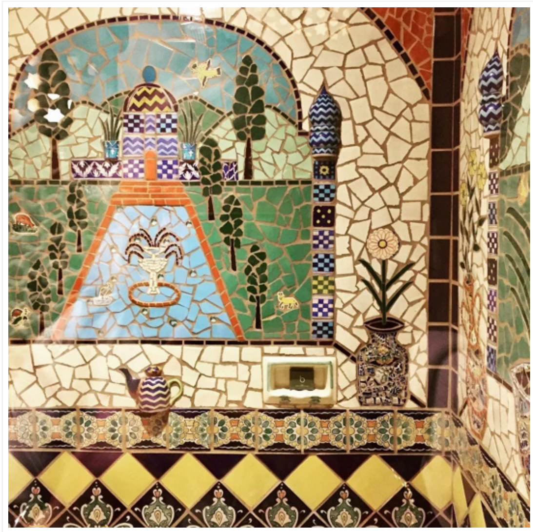
— The Inn of Five Graces – Sylvia Seret Mosaic Tiled bathroom

A desert jewel, The Inn of the Five Graces in Santa Fe wows with exotic decor, raw silks and rich color that seamlessly blends the Southwest with the Far East. Step through its doors, and a feast of color and texture awakens the imagination. Each distinctive room showcases handcrafted artisan pieces and eclectic treasures from the historic Silk Road that once linked Europe and Asia. Echoes of rustic Spain, lingering in New Mexico's Hispanic heritage, are reflected in the diverse style, a trademark synthesis of East and West. The richness will evoke memories of your Journeys to Istanbul and India. The Seret family who own the Inn have roamed the world to bring together Persian, Indian, Tibetan, Uzbek and other Eastern architectural elements and antiques with classic Santa Fe adobe construction. Surprisingly it works, providing an organic yet luxurious warm atmosphere. My suite was made even more cozy with its traditional Kiva wood burning fireplace. Even the curved ceilings are not without décor, wooden doors and trim are hand-carved, and owner Sylvia Seret has created intricate tile mosaics in every bathroom. The mosaics are simply mesmerizing.