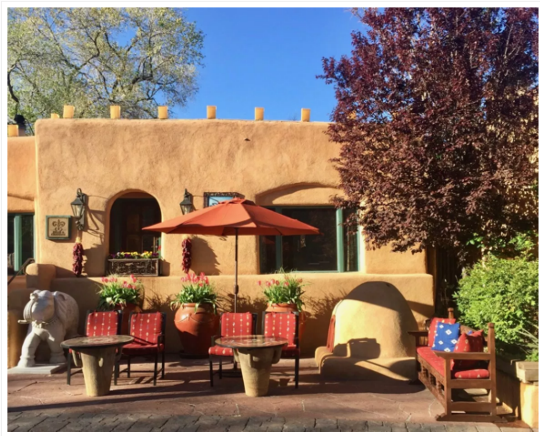
— The Inn of Five Graces Santa Fe, New Mexico

A new full-service spa is opening in the end of summer 2018, The fitness center features professional equipment and weights, allowing guests to maintain their regular routines in Five Graces style. Hidden terraces reached by ancient gates are situated around the petite property. Loungers, not typical hotel loungers, these are exotic wooden Tibetan beds, are stationed under flowering arches, little songbirds flittering about clearly enchanted with the lush gardens. I felt as if I was in a small foreign village.