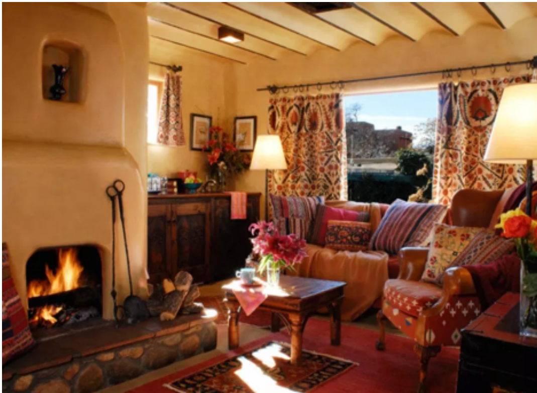
— Inn of the Five Graces Suite

I've been a frequent visitor to this picturesque city, the oldest capital in the United States, the charming city is set at the base of the Sangre de Cristo Mountains and possesses a unique Southwestern charm all its own. A few miles south, these mountains diminish down from a height of 13,000 feet to a flattened level plain, marking the end of the North American Rockies.