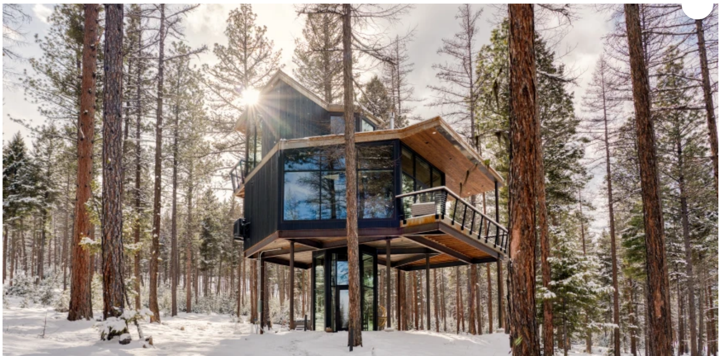
The Tree Haus accommodations at the Green O are elevated 23 feet off the ground.

When it comes to winter travel, you have one of two options: Run from the cold and find some tropical beach where it's sunny right now , or embrace the seasonal chill and opt for maximum coziness. We're talking wintry hideaways where firepits are abundant, the smell of wood smoke fills the air, and the interior design goes heavy on comfy wools and flannels. They're places where it's just as rewarding to go out and explore as it is to sit by a window with a good book and take in