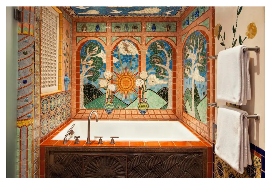
The Inn of the Five Graces in Santa Fe THE INN OF THE FIVE GRACES