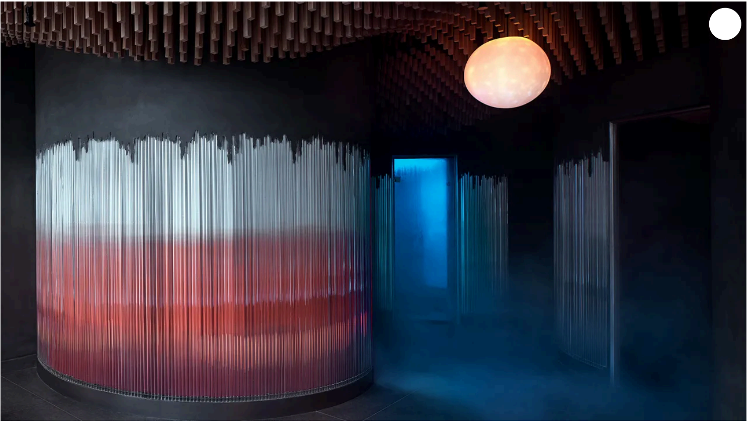
Cellularium Spa, Prague, Czech Republic